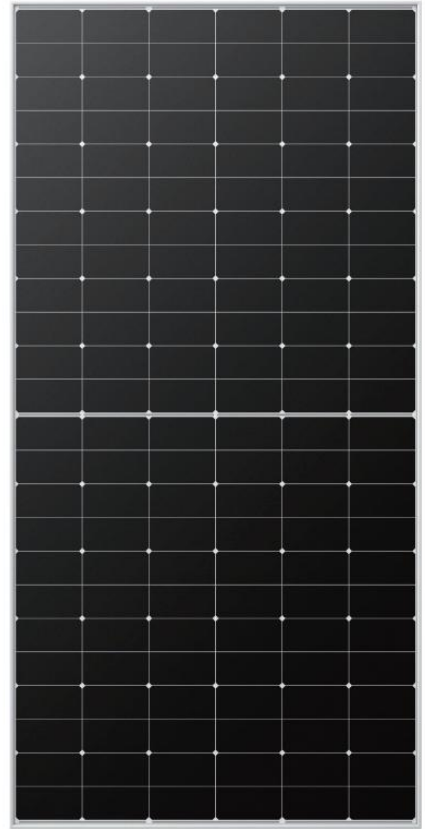
25-Year Power Warranty